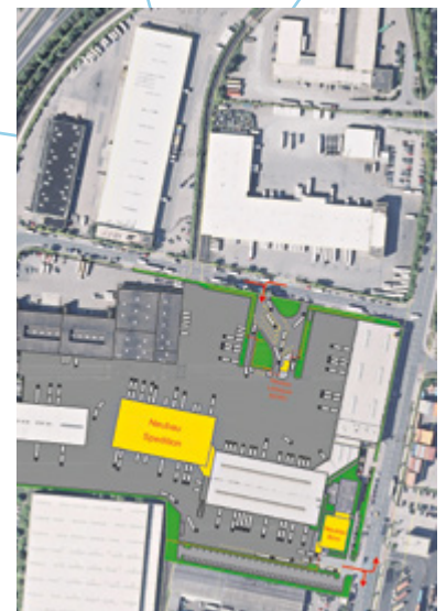
The large-scale expansion of the Geis site in the Nuremberg Freight Village also encompasses an additional office building (left). The bird's eye view (above) shows the site with the extension buildings (in yellow).